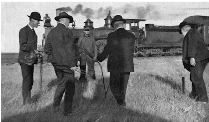
Are they making America Great again, or looking for Inkpen?

A week earlier, on Saturday the 12th July we will be holding a dowsing day.